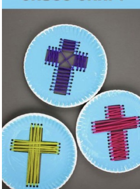
PAPER PLATE AND YARN CROSS CRAFT

Did you know that you can paint with FORKS! Look! They make the cutest flowers! Your kids will love this! Use washable