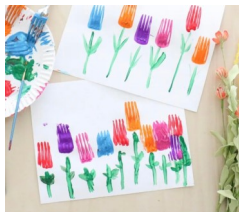
FORK STAMPED TULIPS CRAFT

Its HERE!!!! Welcome Spring! Here are some fun crafts for you and the kids! What a wonderful teaching opportunity God has given us with Easter AND the "re-birth" of so many growing things in the spring! Enjoy!